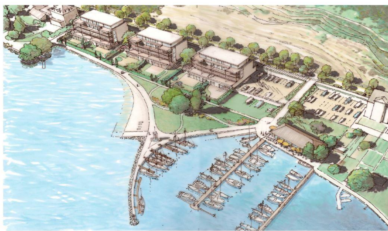
Figure 5 : Une vision réalisée pour le secteur Beau-Rivage, à Bienne.

Using added-value created through densification (blue) to improve public spaces (green spaces)