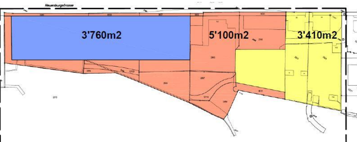
Figure 7 : Le secteur du Beau-Rivage après le projet. La commune hérite de 2060 m 2 supplémentaires tout en permettant la réalisation d'un chemin des rives le long du lac. Elle réalise en outre des recettes brutes de 1.8 millions dans l'opération.